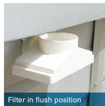
Filter in flush position

To flush the tank roof and gutter prior to the first rains, unlock and pull the Filter Screen away from the tank inlet and turn 180°. Push the filter coupling back to engage with the tank and lock into place.