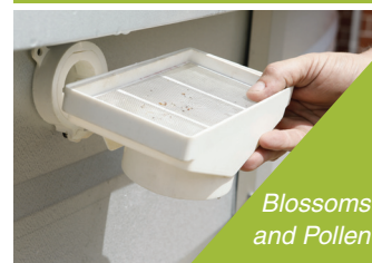
Blossoms and Pollen

You can minimise heavy burdens of tree blossoms and pollen from entering your water tank by cleaning your mesh filter on a regular basis.