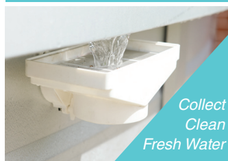
Collect Clean Fresh Water

Turn filter to the 'on' position, to allow clean rainwater into your water tank. Remove any leaves or debris intermittently as they accumulate on top of the mesh filter.