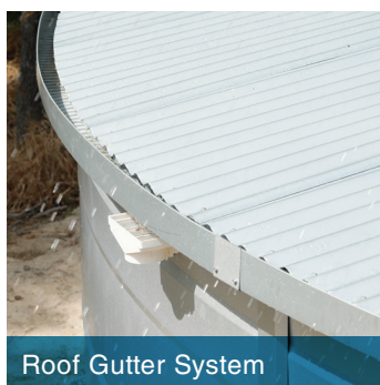
Roof Gutter System

The EvaRain Gutter System collects additional water from the roof of your tank and has the benefit of being able to flush the first rains via a specially designed inlet and filter system. A World First and unlike any other option available in the market.