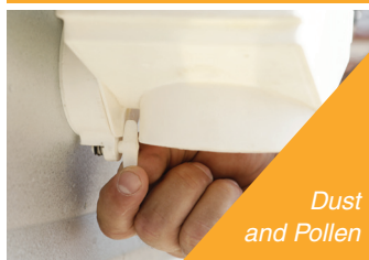
Dust and Pollen

After opening rains or when you clean your water tank roof, you can turn the filter back to the 'on' position, to allow clean water into your tank.