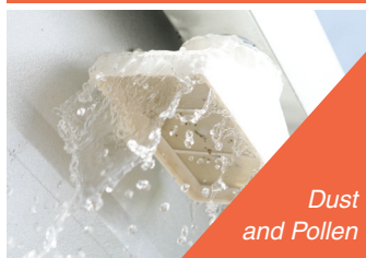
Dust and Pollen

In summer, ensure that your filter is turned to the inverted 'off' position, to ensure that dust and other sediments are not flushed into your tank during light summer rains.