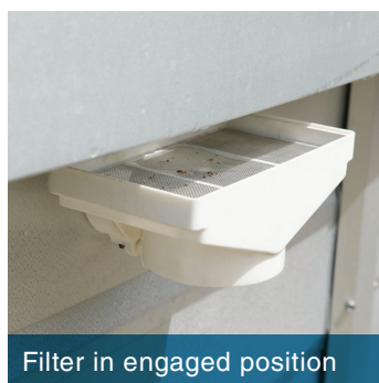
Filter in engaged position

The EvaRain Gutter System collects additional water from the roof of your tank and has the benefit of being able to flush the first rains via a specially designed inlet and filter system. A World First and unlike any other option available in the market.