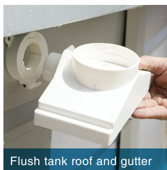
Flush tank roof and gutter

When the filter is in the 'Engaged' position with the filter facing upwards, water that falls on your tank roof can enter the tank via an inlet. The water is also screened by a 0.95mm stainless steel mesh to prevent mosquitoes and debris from entering your tank.