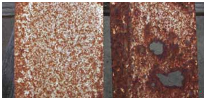
Galvanised Steel Z300 Washed Panels – Exposed for 21 years