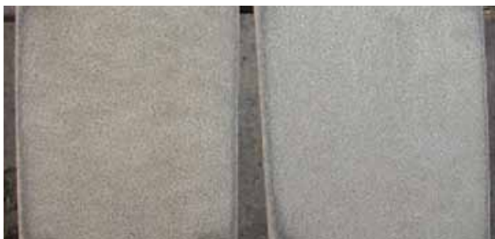
ZINCALUME® Steel AZ150 Washed Panels – Exposed for 21 years

A. Compared to ZINCALUME® AZ150 steel, a Zinc Aluminium coating of AZ70 will reduce the life of the product by more than 50% (or half the life).